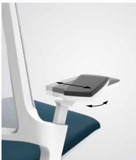
3D T-armrests (height and width-adjustable, can be swivelled)