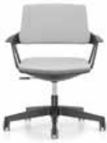
Conference chair, upholstered