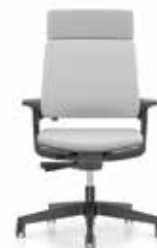
Swivel armchair, upholstered

14M6 with synchronous mechanism and weight regulation