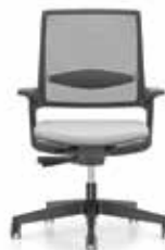
Swivel chair mesh back, upholstered seat

13M6 with synchronous mechanism and weight regulation