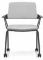
Conference chair, upholstered