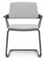
Conference chair, upholstered