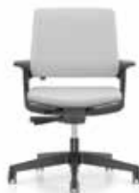
Swivel chair, upholstered