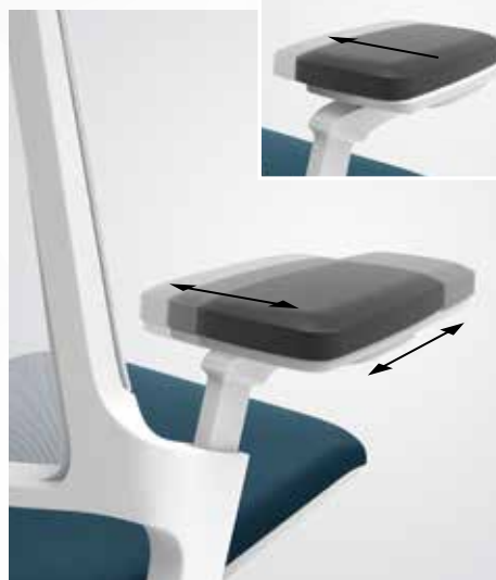
3D T-armrests (height, width and depth-adjustable)

Armrests: optional adjustable armrests are comfortable and relieve strain on arms and shoulders.